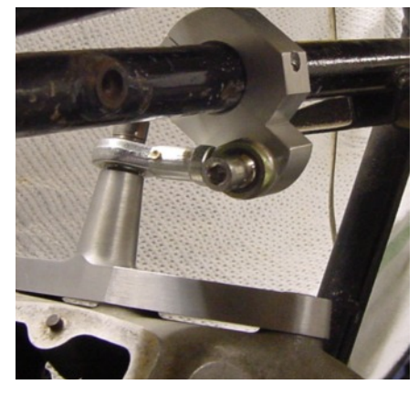
Head steady Fitted